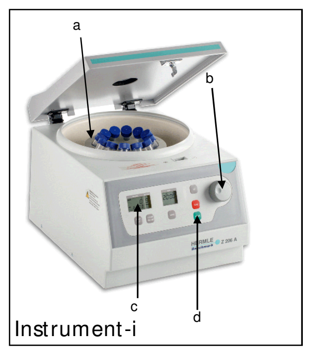
Q1. Identify the following instruments with their use. Name the labelled parts of each instruments with One function of each part (1+1+4+4)\times4=40

The Figure in the margin indicates the full marks